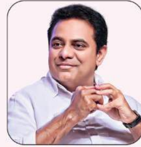
Sri K. Taraka Rama Rao Minister for Industries, Information Technology, Municipal Administration & Urban Development and NRI Affairs.